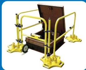
Roof Hatch System with OSHA compliant gate.

In most situations, OSHA (Std. 29 CFR 1910.23) requires guardrail protection on the exposed sides of openings in roofs and floors. BlueWater Mfg. has modified our SafetyRail 2000 guardrail system to meet those safety concerns. Our Roof Hatch/Skylight Systems exceeds OSHA Std. 29 CFR 1910.23 and 1910.27. It is the only product available in the market with a gate assembly that meets the same OSHA regulations and REQUIRES NO DRILLING INTO ANY SURFACE for installation. The Roof Hatch/Skylight Systems set up in minutes and are easily dismantled for roof repair.