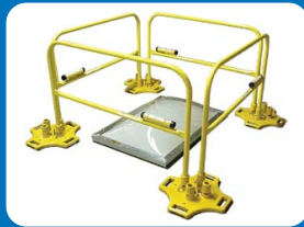
Skylight System protecting a 3' X 4' skylight.