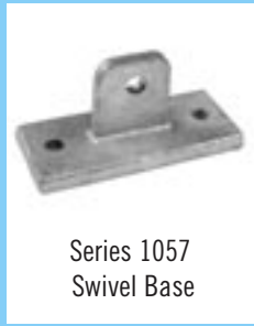
Series 1057 Swivel Base