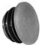
Series 1085 End Cap