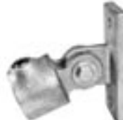
Series 1081 Base Swivel Kit