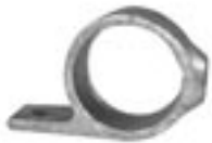
Series 1072 Fixing Pad