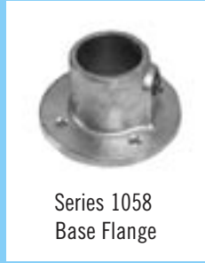
Series 1058 Base Flange