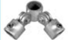
Series 1083 Corner Swivel Kit