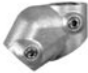
Series 1067 Variable Angle Tee