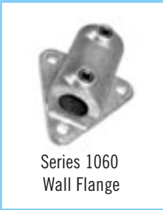
Series 1060 Wall Flange