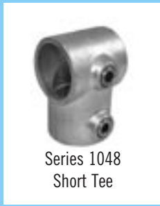
Series 1048 Short Tee