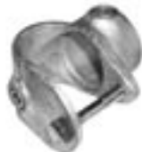
Series 1079 Clamp On Tee