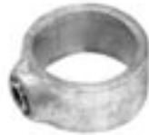
Series 1068 Collar