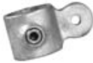
Series 1073 Single Male Swivel