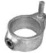
Series 1070 Gate Hinge