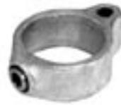
Series 1069 Gate Eye