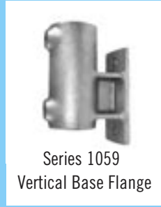
Series 1059 Vertical Base Flange