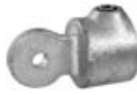
Series 1075 Alt. Male Swivel