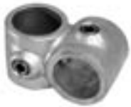
Series 1078 Cross Over