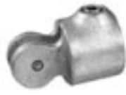
Series 1074 Single Female Swivel