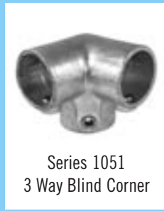
Series 1051 3 Way Blind Corner