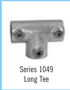
Series 1049 Long Tee