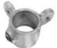
Series 1077 Corner Male Swivel