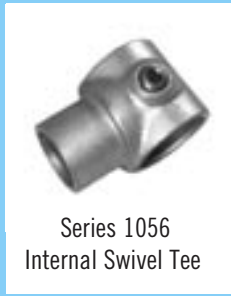
Series 1056 Internal Swivel Tee