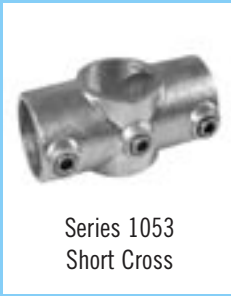
Series 1053 Short Cross