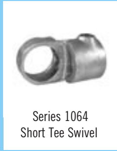
Series 1064 Short Tee Swivel