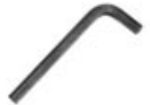
Series 1093 Hex Wrench