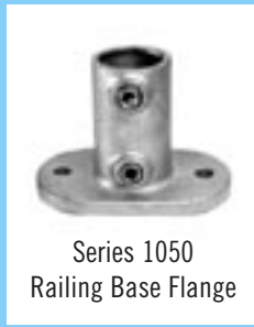
Series 1050 Railing Base Flange