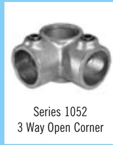
Series 1052 3 Way Open Corner