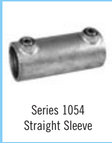
Series 1054 Straight Sleeve