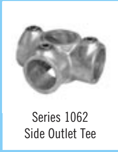
Series 1062 Side Outlet Tee