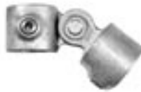
Series 1080 Single Swivel Kit