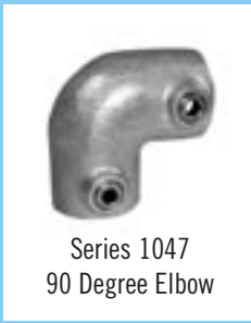
Series 1047 90 Degree Elbow

Kwik-Fit Fittings are stocked to fit schedule 40 pipe sizes 1 inch through 1 1/2 inches. All fittings come with stainless steel set screws as standard. Technical data for Kwik-Fit fittings may be obtained by visiting www.bluewater-mfg.com .